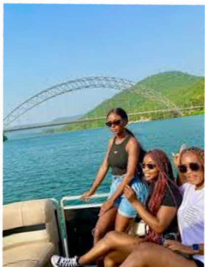
Day trip to Akosombo Volta Lake cruise