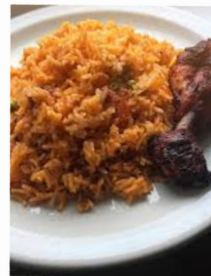
Cooking lesson: jollof, light soup, or waakye