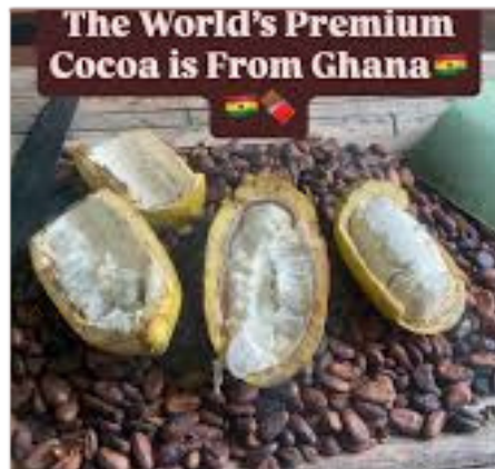
Cocoa farm & chocolate- making workshop