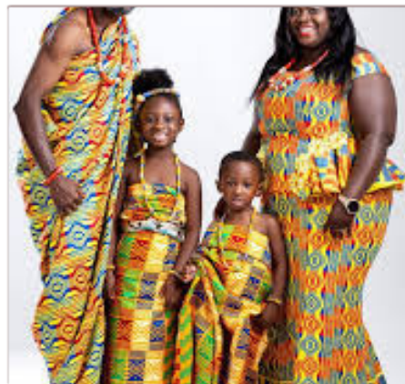
Family photo shoot in traditional attire